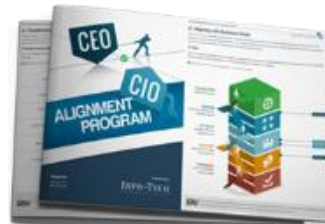
CIO-CEO ALIGNMENT DIAGNOSTIC