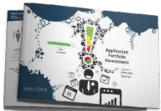
APPLICATION PORTFOLIO ASSESSMENT