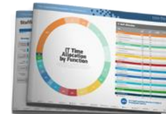
IT STAFFING ASSESSMENT