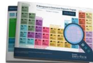
ASSESS CORE IT PROCESSES