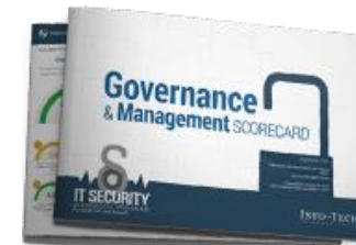
IT SECURITY DIAGNOSTIC PROGRAM