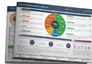
PROJECT PORTFOLIO MANAGEMENT DIAGNOSTIC PROGRAM