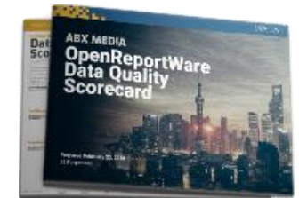
DATA QUALITY SCORECARD

https://lean42.com/lean-packages/it-diagnostics/