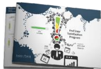
END USER SATISFACTION PROGRAM