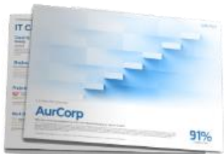
CIO BUSINESS VISION

Use IT assessments to make data-driven IT strategy your most effective weapon.